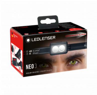
Exemplary Packaging Illustration