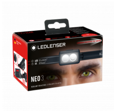
Exemplary Packaging Illustration