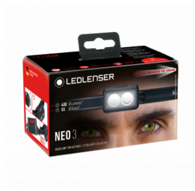
Exemplary Packaging Illustration